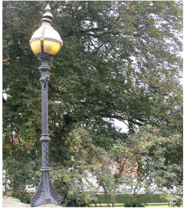
Historic England Archive ref:dp073454