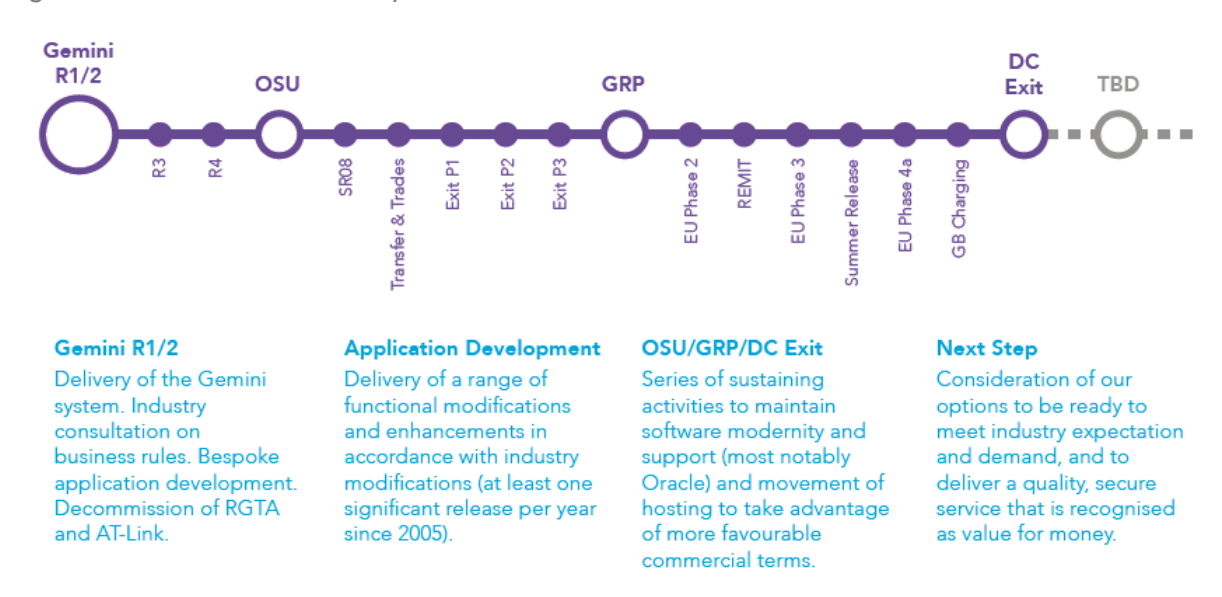
Figure A1.1: Gemini's roadmap to date

diagram below, two such major upgrades have occurred (OSU in 2007 and GRP is 2013) and the latest programme (DC Exit) is being commenced which will be completed in 2020. This approach has enabled Gemini service to continue to deliver to service standards and requirements whilst being efficient, proportional and economical for end consumers. However, following this strategy going forwards will mean the Gemini system will have been live for 16 years at the start of RIIO-2 and 26 years at the end of RIIO3. The below diagram illustrates this sustaining strategy activities since Gemini was implemented.