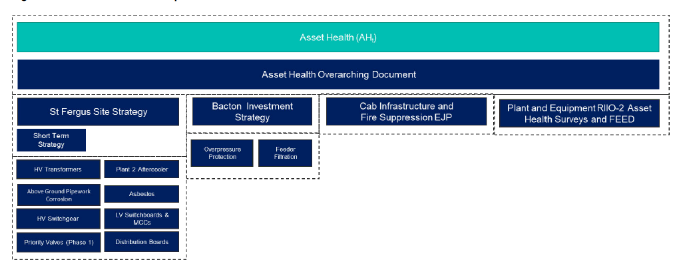
Figure 2 June Asset Health Reopener Submission

For our June submission each document has been assigned a product number to aid the reconciliation between each of the individual EJPs and this Overarching document. The table below (