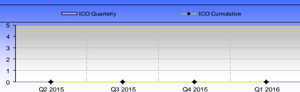
Initial Connection Offers Made - Cumulative Total

0 Full Connection Offers made in Q1 2016